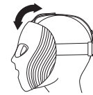
ADJUST TOP STRAP

Adjust the fit to your eye level so it's most comfortable.