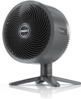
Fan Head (Already assembled)